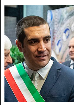
Michele De Pascale, Mayor of Ravenna, Italy